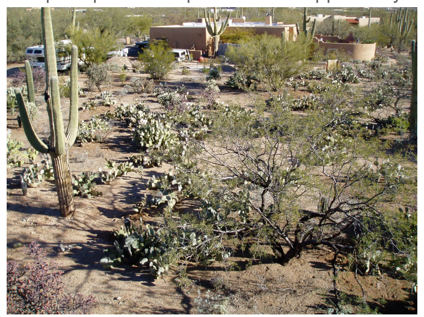
Kept "natural" with thinning & trimming

When streets are put in and homes are built things are no longer 100% natural. Just simple runoff from roofs, patios, driveways, and streets leads to an increase in vegetation. Most people also want to add a little something like rosemary, bougainvillea, lantana, and non-native cactus. To truly keep things natural takes work. At least once a year things need to be trimmed and thinned to create more open space. This provides less opportunity for pack rats and more effective hunting for predators.